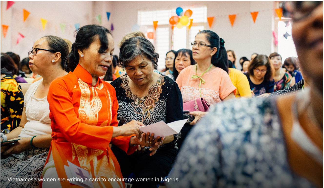
Vietnamese women are writing a card to encourage women in Nigeria.

As is typical under Communist regimes, Vietnamese authorities seek to keep all religious groups under control. Those under particular scrutiny alongside Christians are Cao Dai, Hoa Hao Buddhists and Muslims. Those who organize under government-controlled councils are left largely alone other than censorship of what is preached. Independent groups, however, are treated as serious threats and come under severe pressure from the government, especially their leaders. This can lead to harassment, intimidation, imprisonment, and confiscation of property.